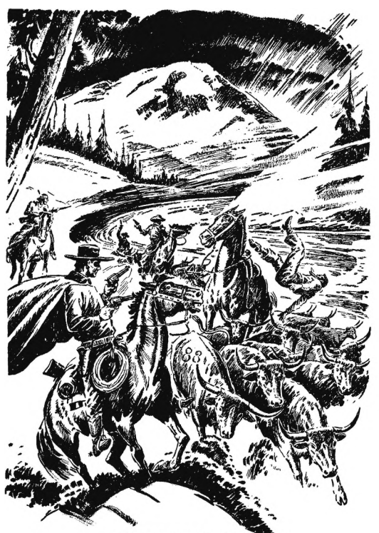
he blasting force of the bullet slammed the raider from saddle (CHAP. IV)